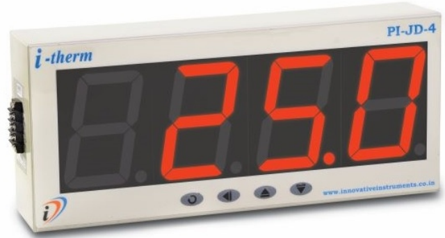
PI-JD-4 (4 Inch)