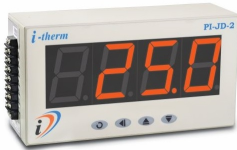
PI-JD-2 (2 Inch)